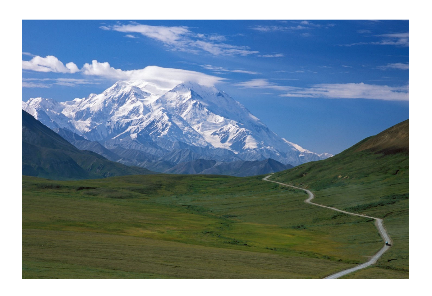
July 14, 2023